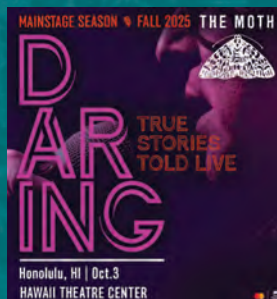
THE MOTH TRUE STORIES TOLD LIVE OCTOBER 3, 2025

HTC members receive discounted tickets on HTC Presents shows