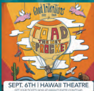
TOAD THE WET SPROCKET GOOD INTENTIONS TOUR SEPTEMBER 6, 2025