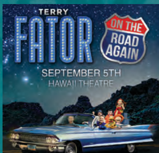
TERRY FATOR ON THE ROAD AGAIN SEPTEMBER 5, 2025