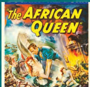
KUPUNA MOVIE MORNINGS "THE AFRICAN QUEEN" (1951) SEPTEMBER 9, 2025