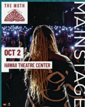
THE MOTH OCTOBER 2ND, 2026