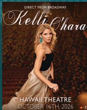
KELLI O'HARA DIRECT FROM BROADWAY OCTOBER 16TH, 2026

HTC members receive discounted tickets on HTC Presents shows