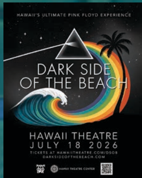
DARK SIDE OF THE BEACH HAWAII'S PINK FLOYD EXPERIENCE JULY 18TH, 2026