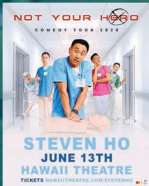
STEVEN HO NOT YOUR HERO COMEDY TOUR JUNE 13TH, 2026